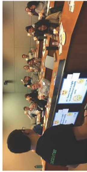
Image 3. PATCH Teen Educators facilitating a 90-minute PATCH for Providers workshop in Madison, Wisconsin.

PATCH teams facilitate two complementary workshops throughout Wisconsin—PATCH for Providers and PATCH for Teens: Peer-to-Peer. The 90-minute PATCH for Providers Workshop helps health care professionals understand the concerns, fears, and preferences of young people in health care settings and provides suggestions on ways to more effectively communicate and build relationships with teens; the 60-minute PATCH for Teens: Peer-to-Peer Workshop empowers young people to begin managing their own health care experiences, and equips them with the knowledge and skills needed to navigate and advocate for youth-friendly services.